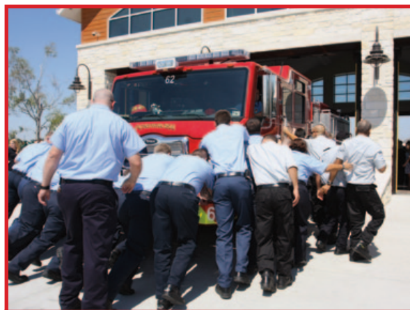
PFD members pushing the fire engine into the new station

Station #62’s apparatus room has three 65-foot pull through bays and is equipped with an automatic exhaust fan system, bay heaters, ¾” and 2” hose bibs, drop-downs for power and compressed air and long trench drains below the vehicles. Large areas of glass in the walls and folding doors provide daylight for the bays and allow the vehicles to be displayed to the community. Bunker gear storage and a shop sit